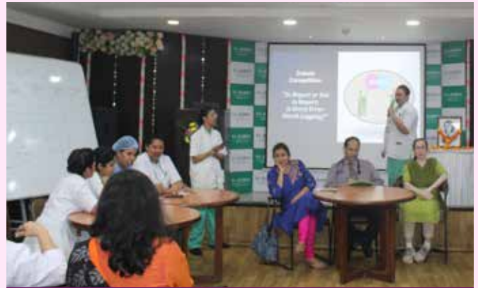
SL Raheja Hospital, Mahim