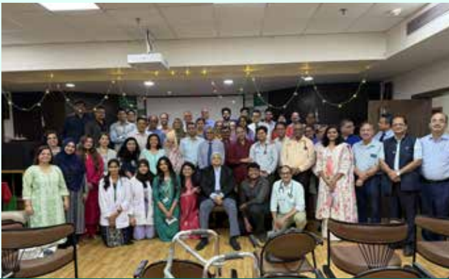
Fortis SL Raheja Mahim