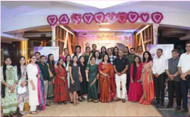
Fortis Hospital, Faridabad