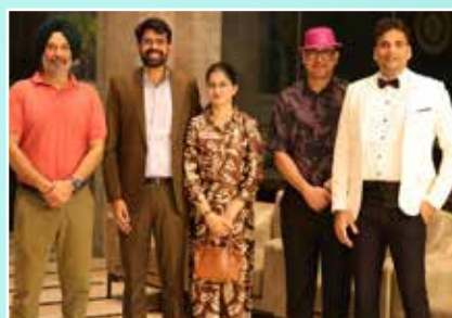
Fortis Escorts Faridabad