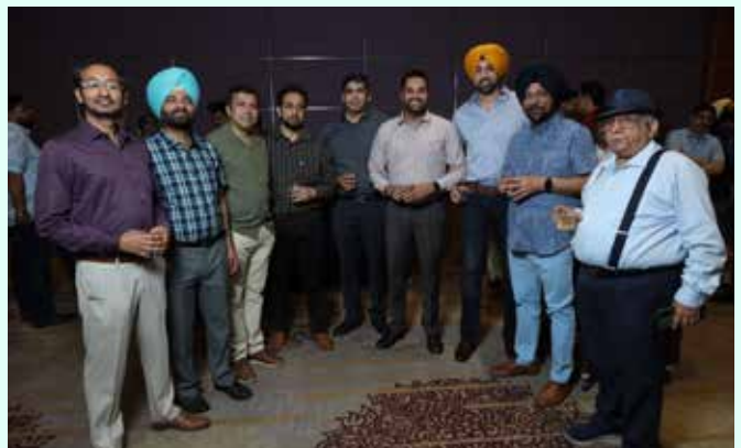
Fortis Escorts Amritsar