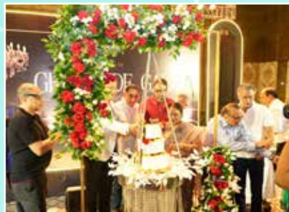
Fortis Memorial Research Institute