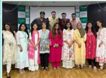
Fortis SL Raheja Mahim