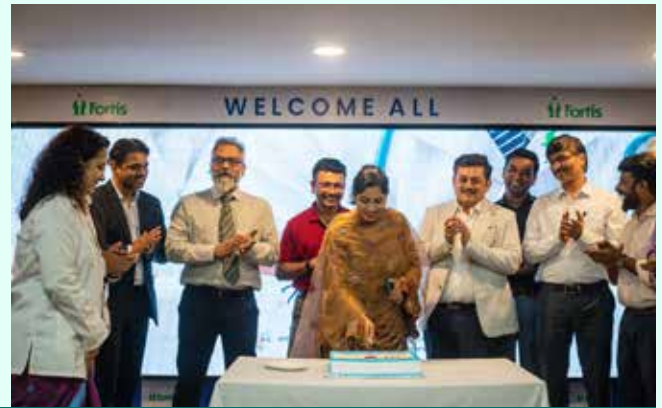
Fortis Hospital, Hiranandani Vashi