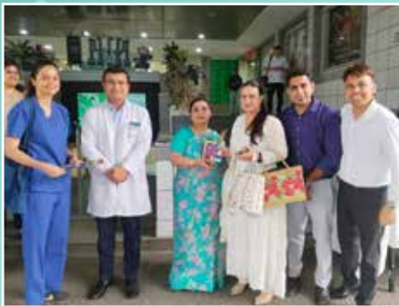
Fortis Hospital, Vasant Kunj