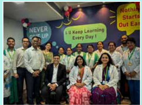
Fortis Hospital, Hiranandani Vashi