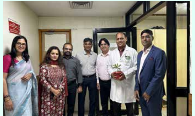
Fortis Hospital, Jaipur