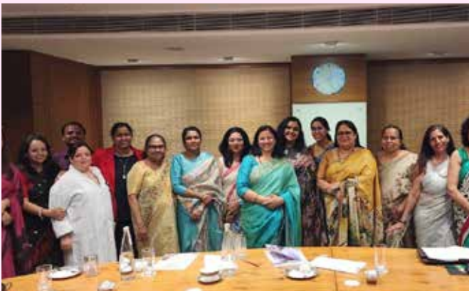
Corporate Office, Gurugram