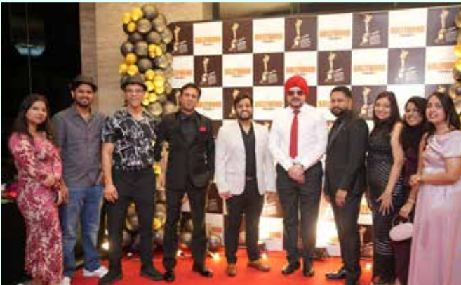
Fortis Escorts Faridabad