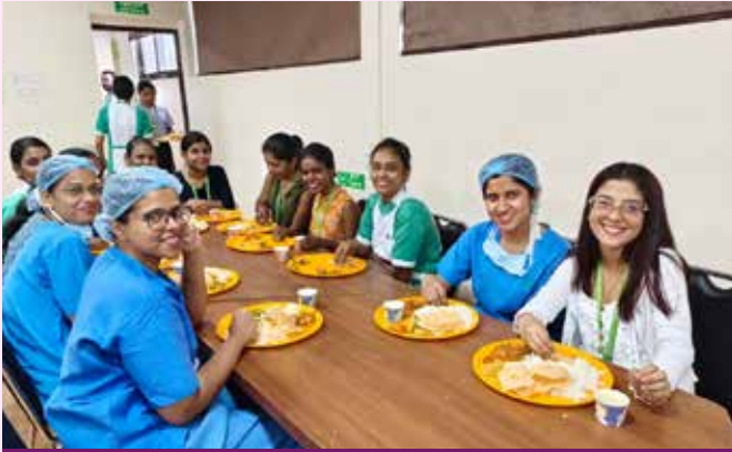
Fortis Hospital, Mulund