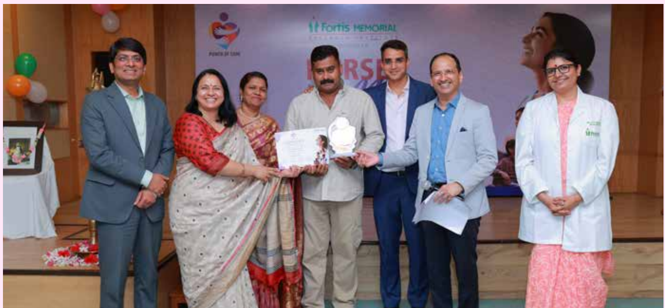
Fortis Memorial Research Institute