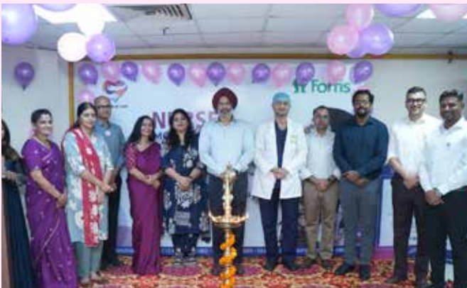
Fortis Hospital, Noida