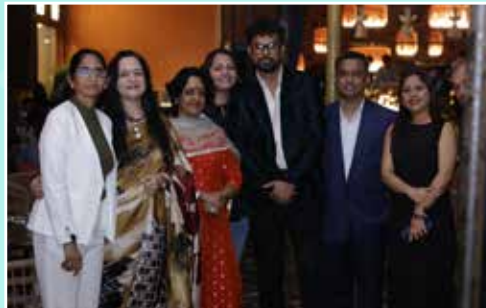
Fortis Hospital, Kalyan