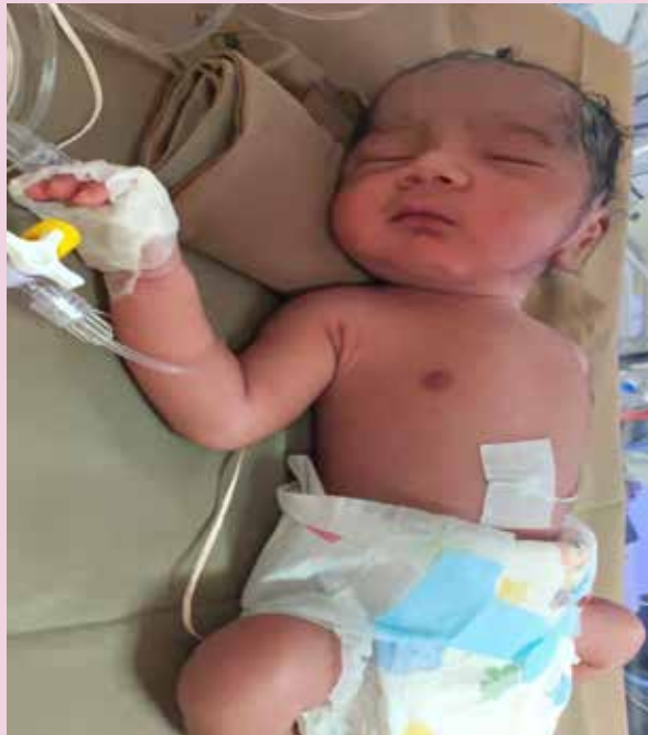
Baby of Kavya CT-Nagarbhavi Unit