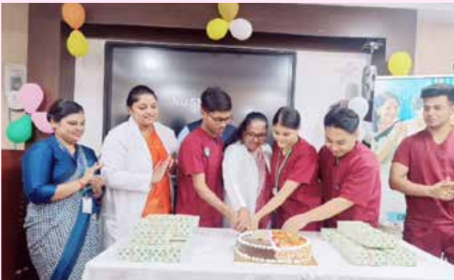
Fortis Hospital, Vasant Kunj