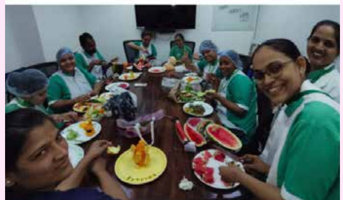
Fortis Hospital, Kalyan