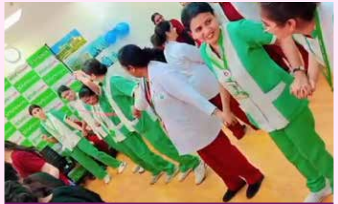
Fortis Escorts Hospital, Amritsar