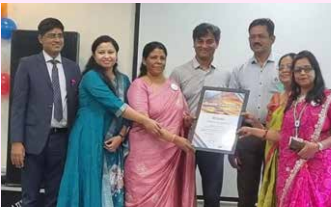
Fortis Hospital, Jaipur