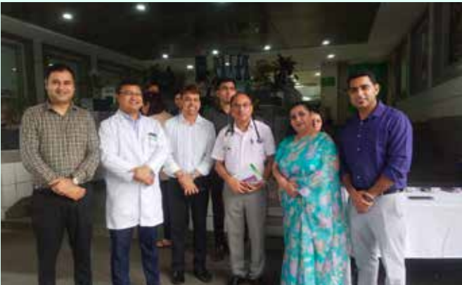
Fortis Hospital, Vasant Kunj