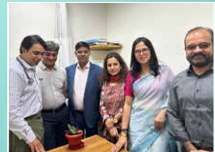
Fortis Hospital, Jaipur