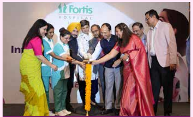
Fortis Hospital, Manesar