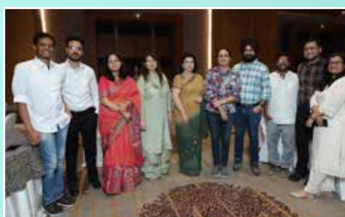
Fortis Escorts Amritsar