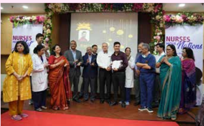
Fortis Escorts Heart Institute