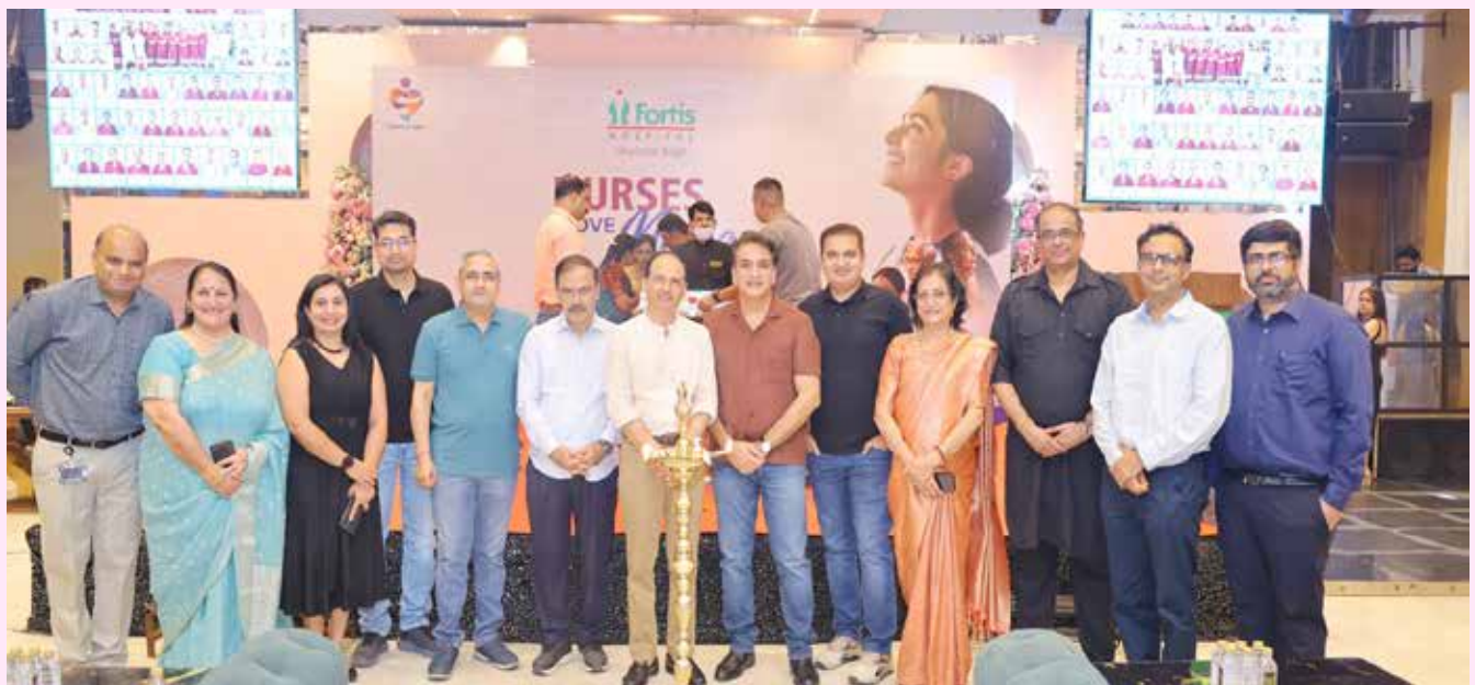
Fortis Hospital, Shalimar Bagh