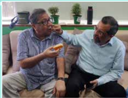
Fortis Hospital & Kidney Institute, Kolkata