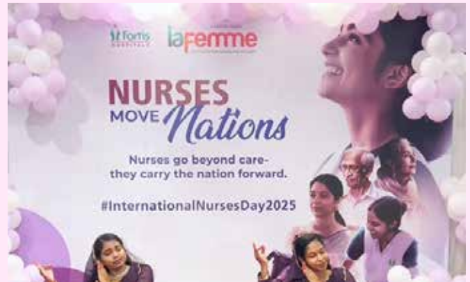
Fortis La Femme, Greater Kailash II