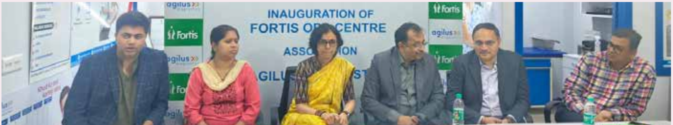
Press briefing announcing the launch

Fortis Healthcare launched a dedicated Super Speciality OPD clinic in Guwahati on May 30, 2025 to enhance healthcare accessibility for the residents of North-East India. The clinic will provide super speciality consultations in Orthopaedics, Urology, Haemato Oncology, Medical Oncology, BMT & Surgical Oncology. This is a first-of-its-kind initiative where patients can avail of consultations with renowned Fortis clinicians along with the services of Agilus Diagnostics, under one roof.