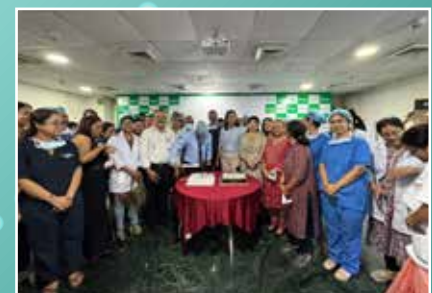
Fortis Hospital, Anandapur