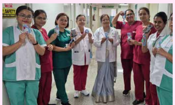
Fortis Hospital, Anandapur