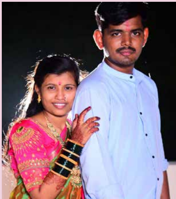
Rajakumar Hikkanagutti-Nagarbhavi Unit