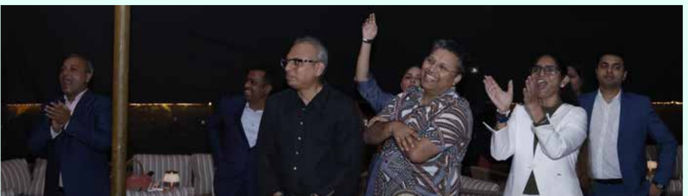
Fortis Hospital, Kalyan