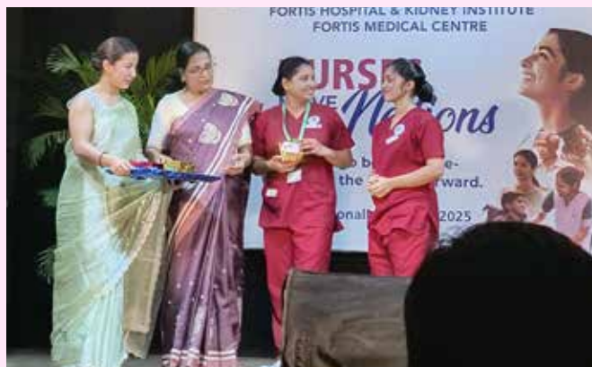
Fortis Hospital & Kidney Institute, Kolkata