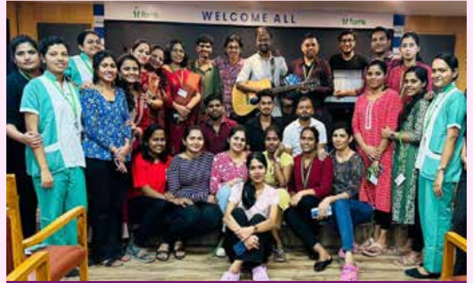
Fortis Hospital, Hiranandani Vashi