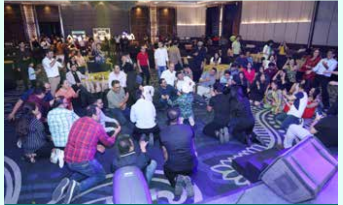
Fortis Hospital, Shalimar Bagh