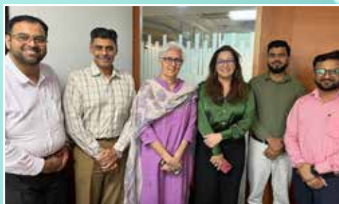
Corporate Office, Gurugram