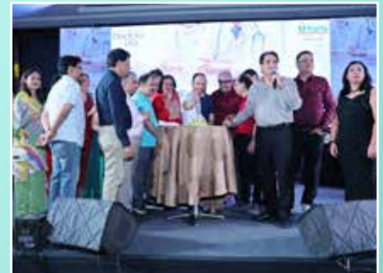
Fortis Hospital, Shalimar Bagh