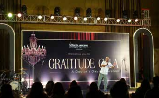
Fortis Memorial Research Institute