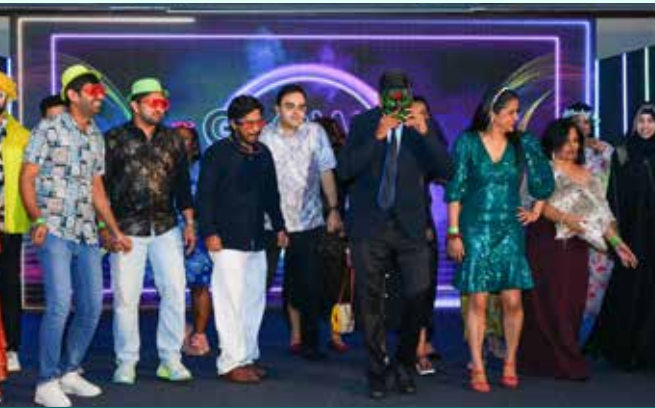
Fortis Hospitals, Bengaluru