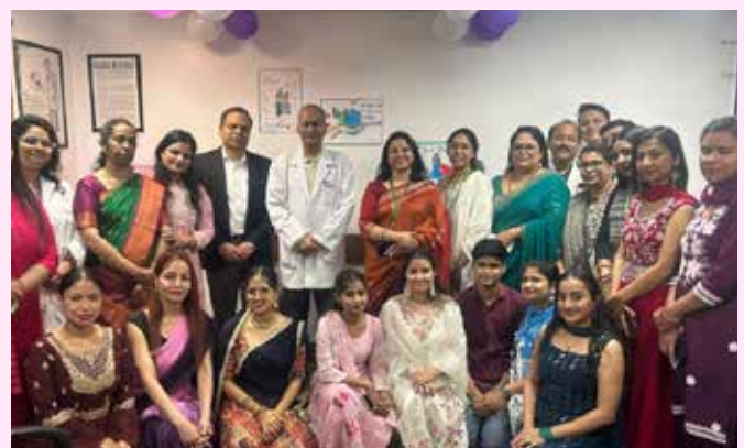
Fortis C-Doc Hospital, Nehru Place