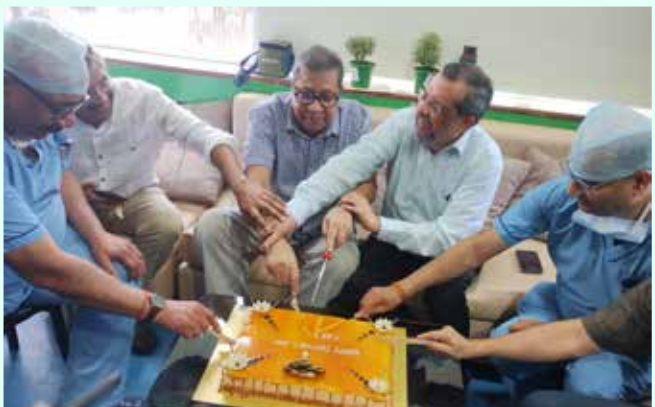
Fortis Hospital & Kidney Institute, Kolkata