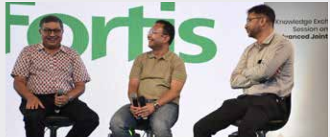
Doctors sharing knowledge

A special Knowledge Exchange session was recently held on May 30, 2025, at Fortis Hospital, Anandapur, highlighting the success of Robotic Orthopaedic Surgeries. The event drew over 200 recovered patients, their families and representatives from Corporates, RWAs, and retired Government/PSU sectors. Attendees witnessed first-hand how robotic surgery is revolutionising joint care. Patients shared their recovery stories while doctors explained how advanced technology is making joint replacements more precise, less invasive, and quicker to heal.