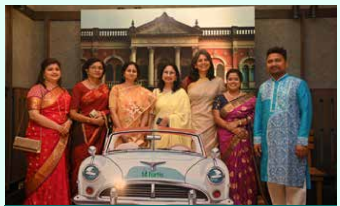
Fortis Hospital, Anandapur