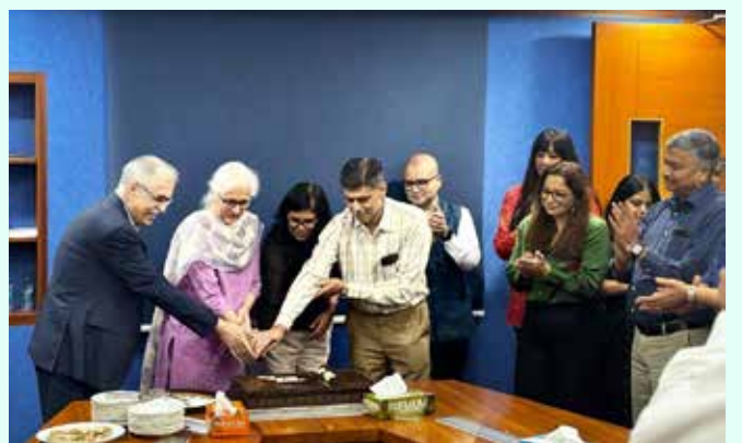
Corporate Office, Gurugram